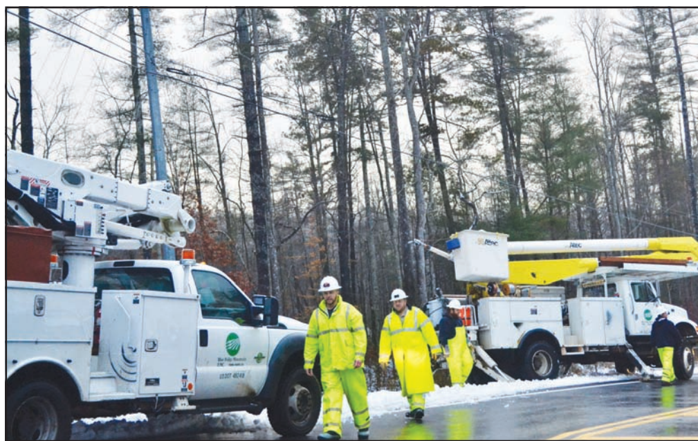
A Blue Ridge Mountain EMC crew working downed powerlines on Georgia 75 in Hiawassee on Sunday, Dec. 9.