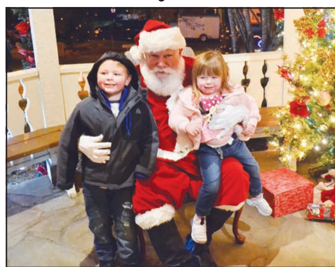
Santa Claus taking requests from two youngsters in the gazebo on the Hiawassee Town Square during Light Up Hiawassee on Thursday, Dec. 6.

While the crowd waited for that namesake moment, they were invited to take part in holiday games and enjoy some good food. Volunteers with the local Veterans of Foreign Wars Post 7807 grilled up hot dogs while Red Cross members