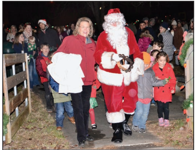
Children of Towns County following Santa Claus into Young Harris City Hall on Friday, Dec. 7.